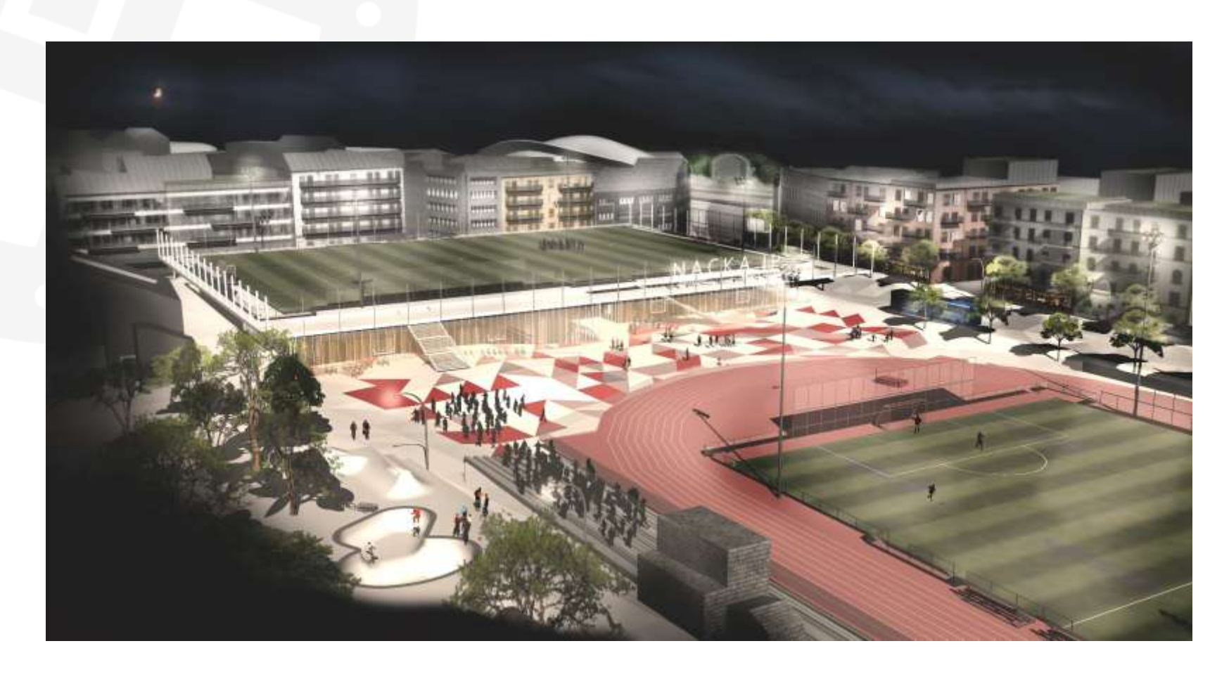
Sports ground in central Nacka