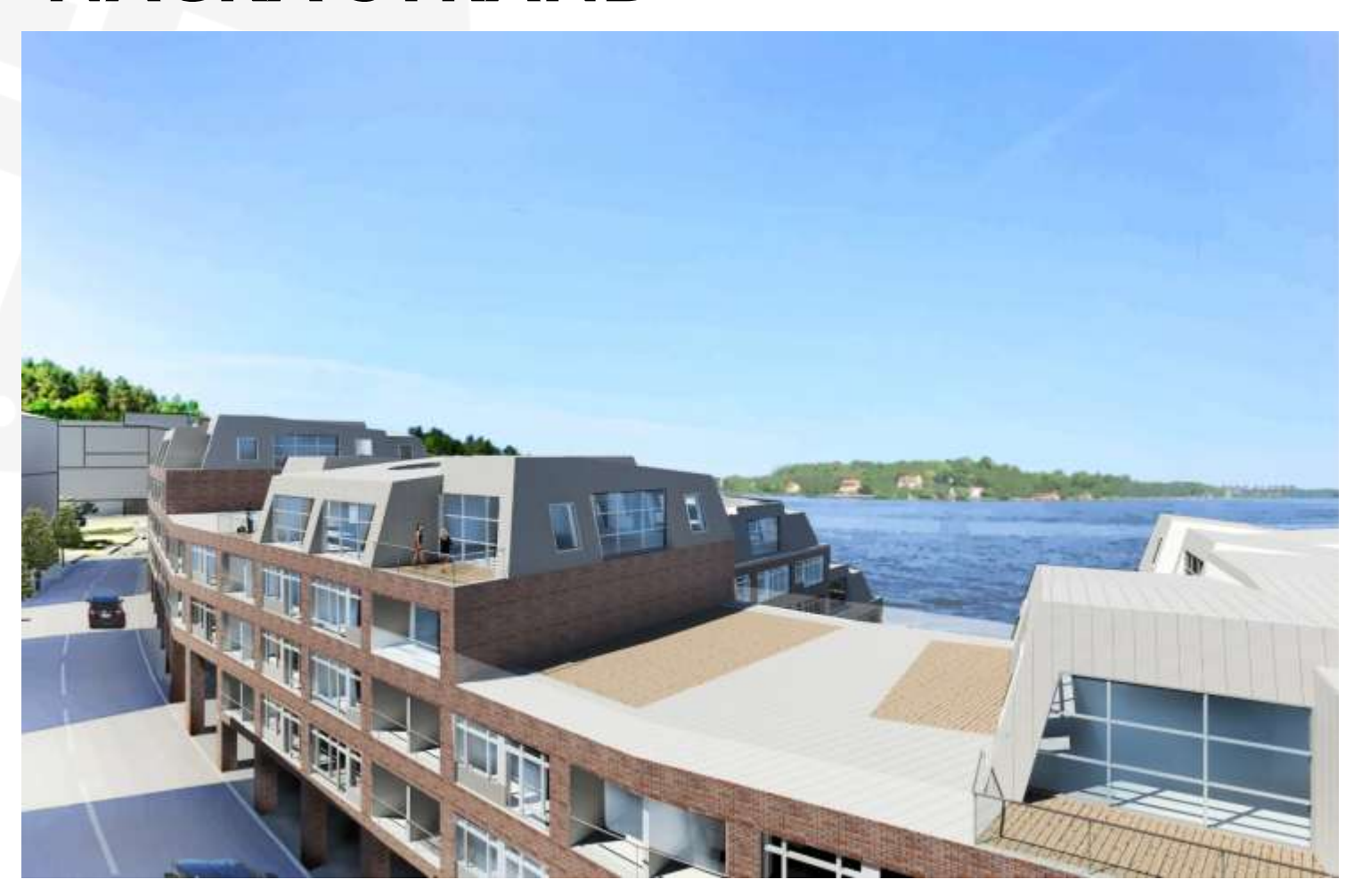
With 1,500 new homes, and more flexible workplaces Nacka strand will be a attractive district with a strong identity.