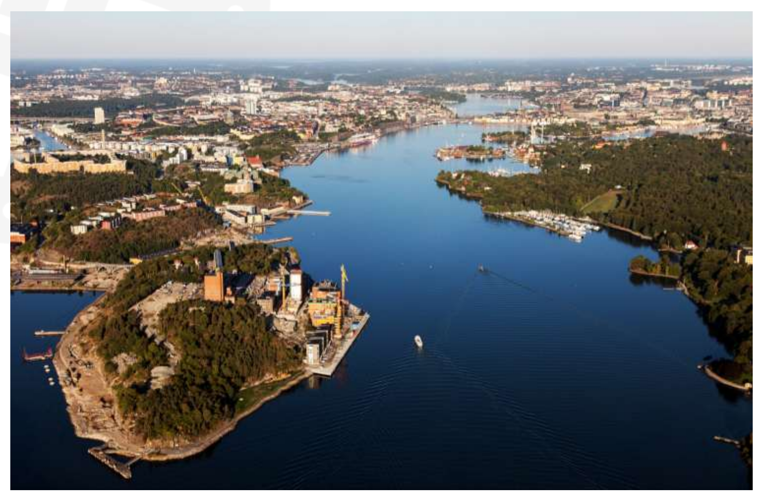
3,000 new homes and the same number of workplaces in a unique archipelago setting just 3.5 kilometres from Stockholmakon.